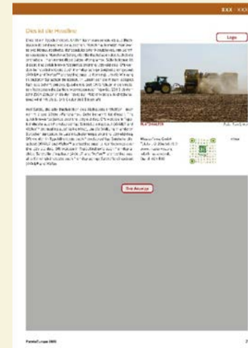
Advertisement + PR + QR code

Info & booking: b.biedka@dlg.org | +49 69 24788-921 | anzeigen-afm@dlg.org