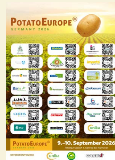
Logo + QR code on the exhibitor page in the magazine